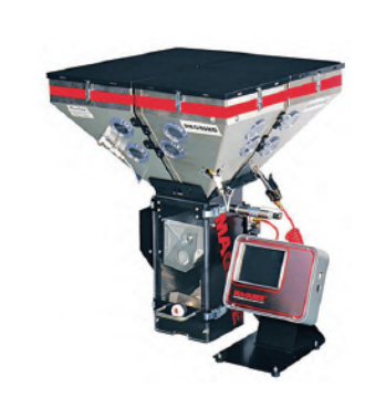
MAGUIRE blender(optional), and its function is to automatically cut and mix according to the proportion of raw materials.