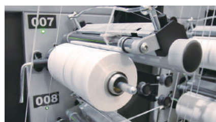
Inverter type and automatic tension control winder, the light-weight design of the tape guide slide achieves power saving performance, and the winding shaft is equipped with a hooking device to facilitate the roll change.