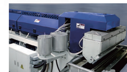
Double layer auto filter change and T-die thermal insulation design.