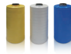
Tape Line Jumbo Making Machine / TLJM Series EXTRUSION TAPE LINE