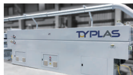
The design of air volume rectifier and uniform heating inside the extended oven makes the high denier tape achieve the effect of extended average.