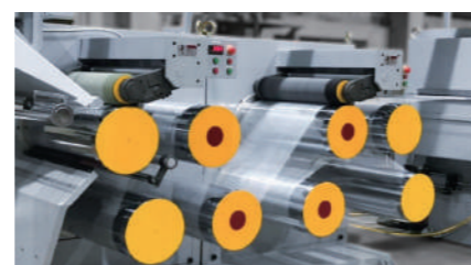
The process design of stretching and preheating roller make high denier tape to achieve the tape stability.