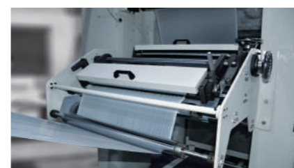
High denier tape adopts two-component knife with non-stop design and swing device to increase production efficiency and also extend blade life.