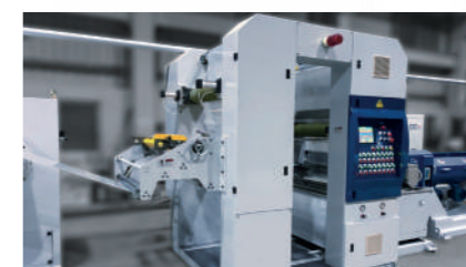
Quench take-up unit, with extrusion device, film cooling forming, and water removal system to keep the film even.