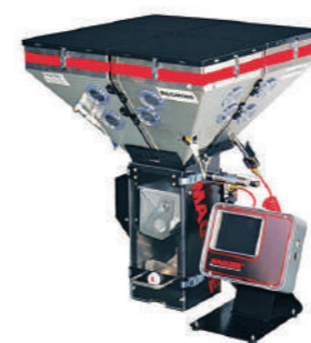
MAGUIRE blender(optional), and its function is to automatically cut and mix according to the proportion of raw materials.