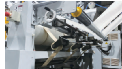
Teflon tape device with belt type, two side or unilateral adjustments.