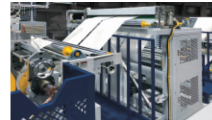
PP Surface treatment corona and PP woven bag turn bar device.