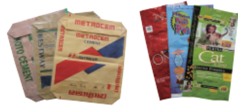
PP Tubular Woven Bag and BOPP Laminating Machine / LMBO Series EXTRUSION LAMINATING