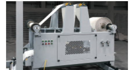
The unwinder is equipped with cloth roll missing cloth detection and automatic roll change design, make operations more convenient.