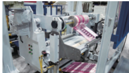
The unwinder of BOPP sandwich laminating machine, and the take up motion of unwinder can range into two types which are speed decrease or not decrease.