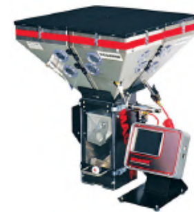
MAGUIRE blender(optional), and its function is to automatically cut and mix according to the proportion of raw materials.