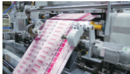
EPC automatic edge cutter device, color film can effectively align and adjust the trim size.