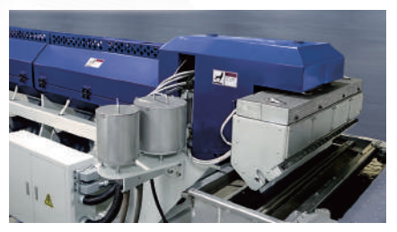
Double layer auto filter change and T-die thermal insulation design.