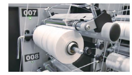
Inverter type and automatic tension control winder, the light-weight design of the tape guide slide achieves power saving performance, and the winding shaft is equipped with a hooking device to facilitate the roll change.