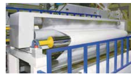
Corona surface treatment is beneficial for lamination bonding and adhesion.